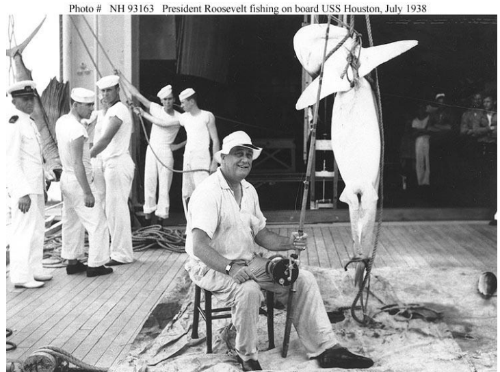
President Roosevelt fishing on board USS Houston, July 1938

In the remaining chapters of the book, Hornfischer tells the remaining story of the HOUSTON, her WWII battles in early 1942 as part of the ill prepared ABDA (American, British Dutch Australian) joint naval task force. The ABDA sought to defend the “Malay Barrier” (Malaya, Singapore, and the Netherlands Indies [Sumatra, Java, Timor, Bali and New Guinea]) to keep Japanese out of the Indian Ocean and Australia. After her loss, on 28 February 1942 in the Battle of Sunda Strait, Hornfischer documents the plight of the few remaining crew at the hands of the Japanese. Many of them were assigned to construction camps at the northern end of the planned railroad linking Burma with Thailand via the Kwai River Valley to the south. The brutal conditions under which these prisoners worked made the conditions described in the Hollywood movie The Bridge on the River Kwai look like a “Cake Walk.” The book ends with the story of the few of the remaining crew who were rescued at the end of the war and their efforts to memorialize the HOUSTON.