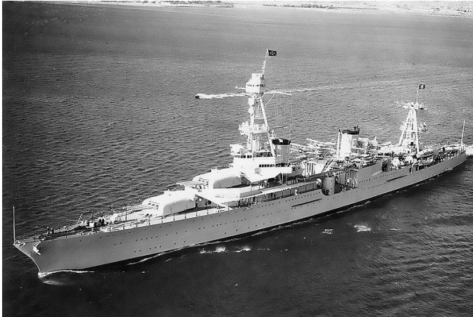
U.S.S. HOUSTON in San Francisco Bay 14 July 1938

feelings of the crew were perhaps best expressed by all shouting, ‘What a shipmate!’” 4 With Admiral Bloch, commander of the U.S. Fleet, on board the HOUSTON, flying the presidential flag from the mainmast, sailed past the ships assembled receiving 21-gun salutes as it passed each ship. Sailing out of the bay the HOUSTON set her course for San Diego.